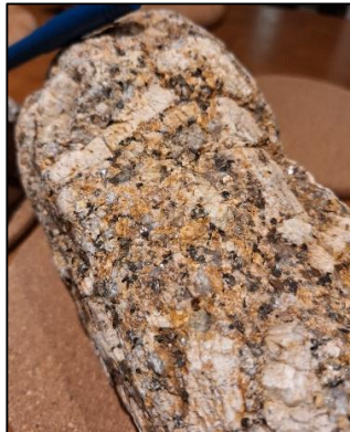
Cornish Granite, a precursor of the clays used in pottery.