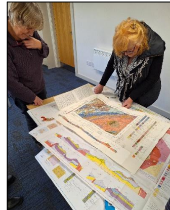
We also had the opportunity to look at members' geological maps.