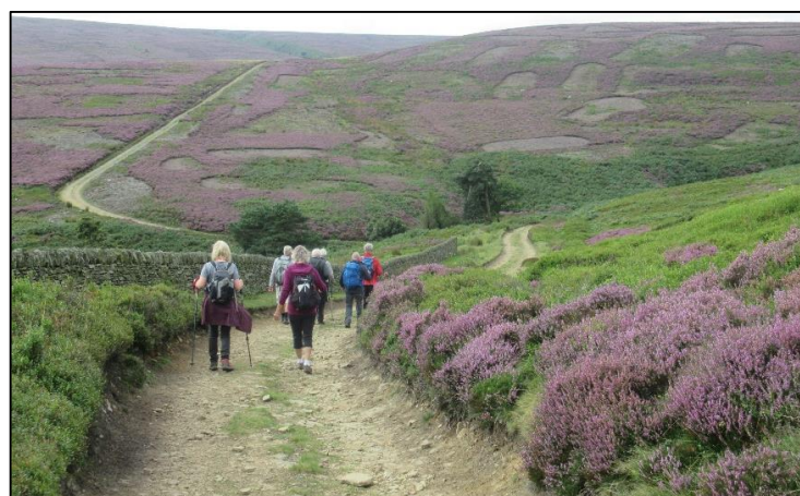
Hordron Road, Langsett – Brian Smyth