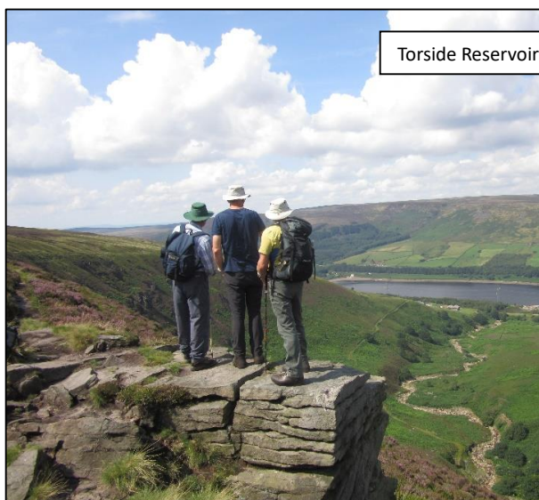
Torside Reservoir – Brian Smyth