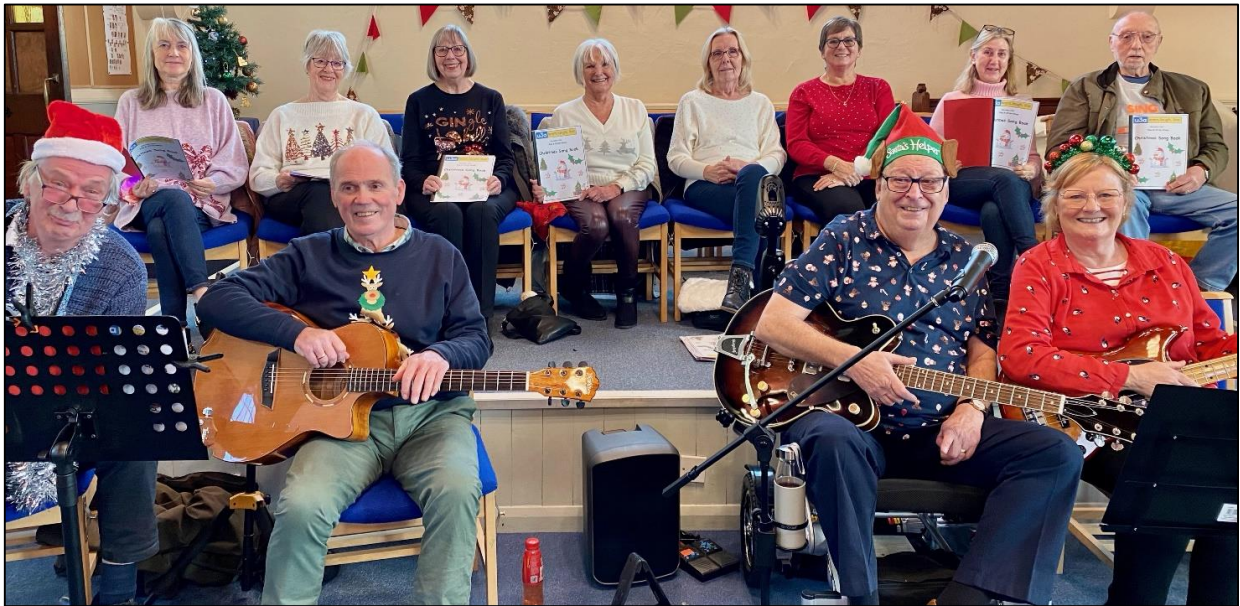
Here are some members of Sing n' Strum helping to raise Money for the Dodworth Methodist Church in December.